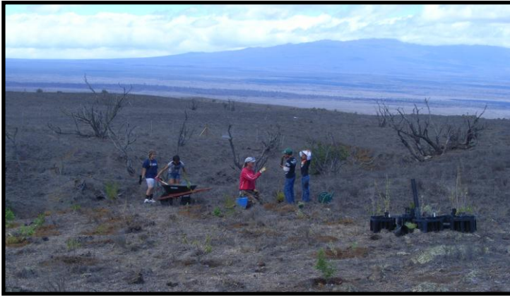
Volunteers work to protect a tropical montane cloud forest.

construction. Many of the students have not previously worked in a cloud forest, so this activity will provide a special learning experience to those who make the journey to this site.