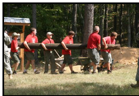
Youth volunteers carry materials to the bridge construction area.

At Willett Springs on September 23 and 24, a floating wooden boardwalk was constructed and installed with volunteers from the FM-ARNG training center. On September 25, the Scouts replaced a small wooden footbridge and constructed a short access trail. Twelve Boy Scouts and their leaders, along with six Girl Scouts and their leaders, worked to construct the bridge, trail and clear a small area beside the spring for planting native perennials. Scouts worked for about eight hours clearing vegetation, hauling gravel, installing landscape timbers and constructing a footbridge. Scouts also assisted staff archaeologists in adding signage with cultural resource information about Willett Springs.