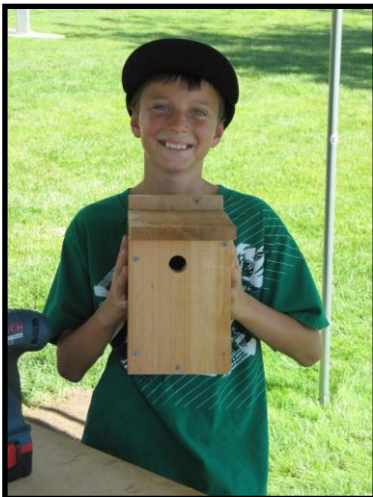
A volunteer shows off a finished wren bird house box.

Project Summary: On NPLD, volunteers at Fallbrook Naval Weapons Station constructed animal nesting boxes. Members of the local community and Cub Scouts assisted those at Fallbrook to make 22 wren bird house boxes, 20 large bat condos, and seven smaller bat boxes. Volunteers also partially completed six owl boxes, which were later finished by base employees. A local elementary school assembled an additional 10 bird boxes for the Station as part of their classroom curricula. The students ceremoniously delivered the assembled bat and bird boxes to the Station's conservation program manager during an event featuring animal demonstrations by Project Wildlife at their school. The Scouts that were involved in building bird box kits earned wood working merit badges and helped teach volunteers how to assemble the kits