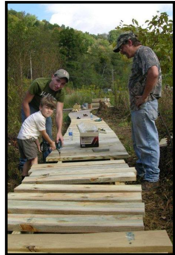
Volunteers of all ages worked to lengthen Camp Dawson's interpretive trail.