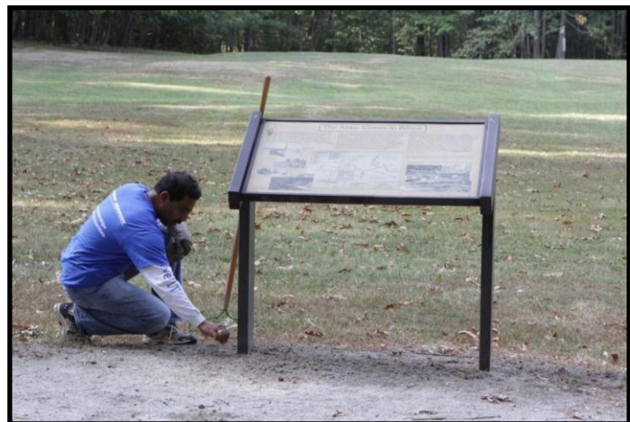
A volunteer rakes around a newly scrubbed sign.

Forty five individuals, more than anticipated, worked on one or more of the projects. Volunteers included, Quantico Young Marines, Girl Scouts Brownie Troop 1889, the Naval Chaplains Office, Northrop Grumman, Fort Belvoir Civilian & Contractor and the local