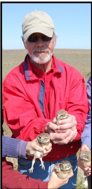
Project leader bands burrowing owls.