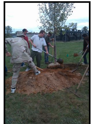
Trees are added as part of an urban forestry initiative at Fort Custer.