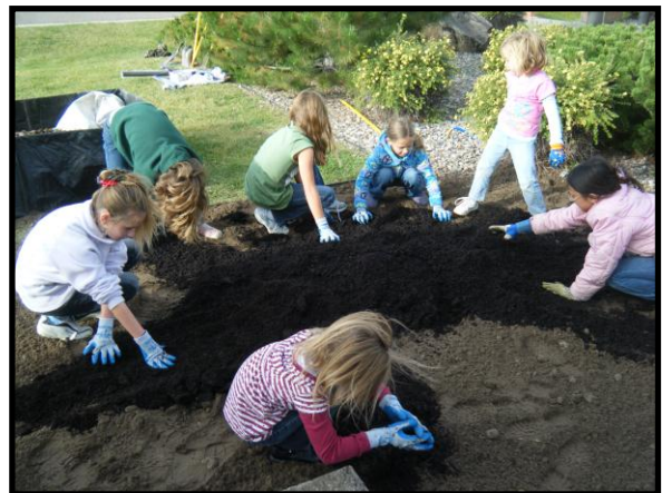
Girl Scouts prepare the Medal of Honor Memorial Park butterfly garden site.

Each group worked on one of the four projects. Girl Scout Junior Troop 3135 prepared the Medal of Honor Memorial Park butterfly garden site by removing rocks, digging a bedding area for plants and adding soil, compost, weed barrier and river rock. Five active duty volunteers removed and recycled 40 t-posts. Four of the posts were re-furbished and were later used to stabilize newly planted cottonwood trees. The remaining 36 t-posts were assembled into bird houses by a troop of 25 Cub Scouts. The Scouts also removed 40 pounds of debris at the Base's Pow Wow Park. During these projects, the Cub Scouts were introduced to the Base's wetland ecosystems and learned about migratory birds from a local environmental educator.