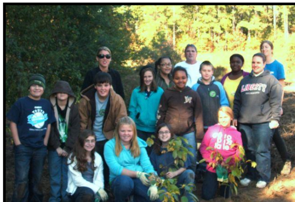
Students display a few of the over 50 shrubs they planted.

The day before the school group arrived, staff prepared the pollinator site by mowing existing brush and creating a 10 inch layer of soil, composed of vegetative matter and wood chips. The next day, 18 volunteers planted 65 native shrubs at the garden site. After planting the shrubs, students mixed five varieties of native wildflower seed and spread it over 13,000 square feet. All students were given hand lenses, donated by a local consulting company. Students could use these to identify plants and seed in the field, becoming more aware of native species in their community.