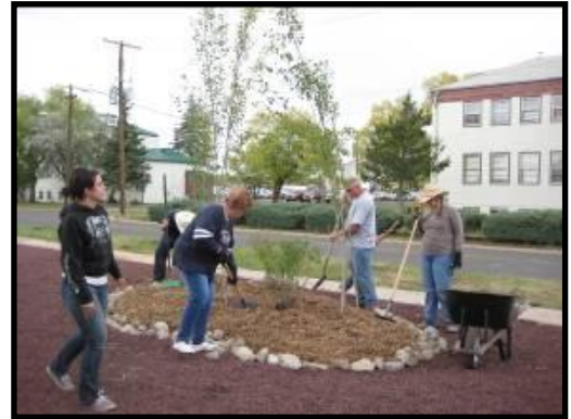
Volunteers plant native drought tolerant vegetation.

During the October 5-6 Eagle Scout leadership service project, 36 volunteers planted over 100 native species, laid red landscaping cinder and mulch, added river rock borders and installed signs. The native vegetation added around buildings consisted of various drought tolerant trees and shrubs known to attract pollinators. The volunteers also installed signage by the kiosk and Historic District entrance. Plant identification plaques detailed the species' common and scientific names and also provide information about their habit, water needs, uses for wildlife and ethno-botanical uses. One educational sign also explained the importance of native landscaping, pollinators and water conservation.